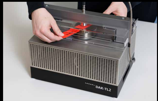
Short calibration with DAK-TL2