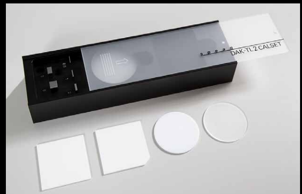
DAK-TL2 calibration set