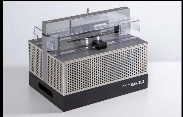
DAK-TL2 with protective covers required for user safety

For further information and technical specifications, visit www.speag.swiss